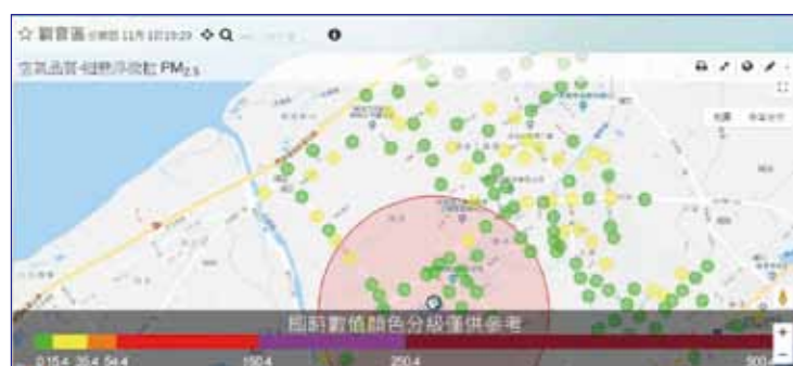
↑ The EPA's iEnv website ( https://ienv.epa.gov.tw )

The EPA noted that it has cracked down on multiple violation incidents by combining environmental sensing IoT and smart detection functions. It proves that the