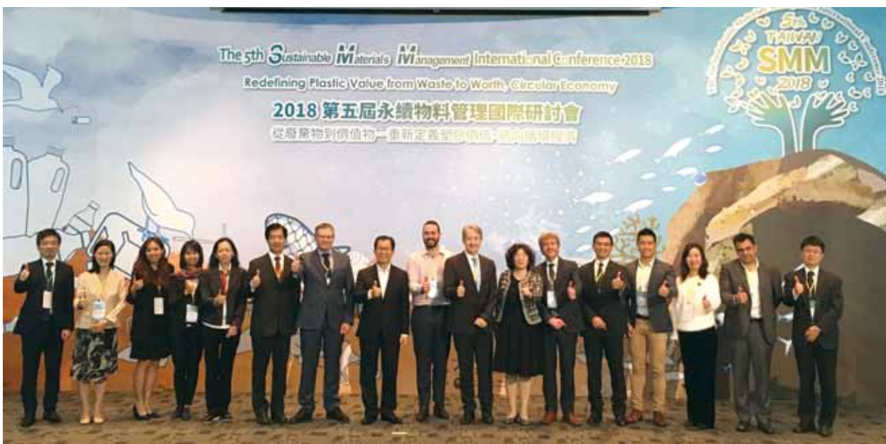
📍 Opening of International Conference of SMM