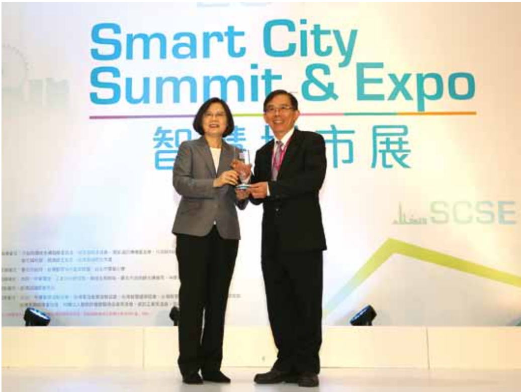
President Tsai Ing-Wen (left) presents the Innovative Application Award to the EPA for its "Smart Environmental Management: Environmental Internet of Things Smart Enforcement Application" program.

several factors that contributed to this project's success. The EPA integrated air quality sensing equipment at industrial developments, overcame energy issues for field deployment and set up a system for screening and reviewing aggregated data. The environmental IoT features innovative analysis and visualization applications. Kwanyin Industrial Park in Taoyuan, Yingge and Dalinpu served as trial areas for the early stages of the project. During the implementation process, each sensor node was closely connected.