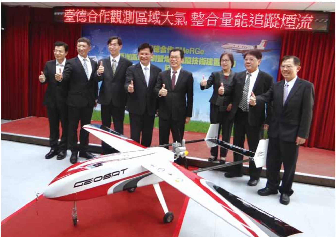
📍 EPA Minister Ying-Yuan Lee (fourth from right) and Mayor of Taichung City Chia-Lung Lin (fourth from left) attend the press conference for the Taiwan-Germany cooperation on regional atmospheric monitoring.

PM 2.5 , many questions still remain. Tracking the plumes of polluted air is fundamental to clarifying the sources of the pollution. By releasing tracers in