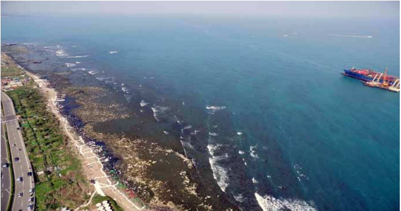
📍 An unmanned aerial system monitors an oil spill where the TS Taipei ran aground in 2016.

advising local governments on being better equipped and prepared. Once a pollution incident occurs, the EPA supervises and coordinates responsible central and local authorities under the Major Marine Pollution Incident Emergency Response Plan . This ensures that response measures are thoroughly carried out at all levels and emergencies are properly handled.