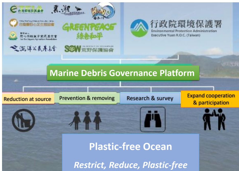
← Taiwan's Marine Debris Governance Platform.

environmental education were held. The EPA hopes that with the combined efforts and resources of governments and the public, the marine environment and resources will be better protected.