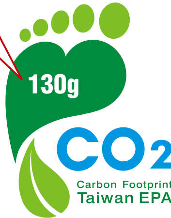
Product Carbon Footprint