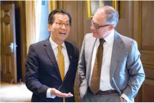
➡ Minister Ying-Yuan Lee meets Administrator Scott Pruitt of the USEPA

launched and promoted by the Taiwan and US EPAs in 2014, as well as issues on energy saving and nuclear waste. They agreed that the two EPAs would continue to work together on the common goal of sustainable development.