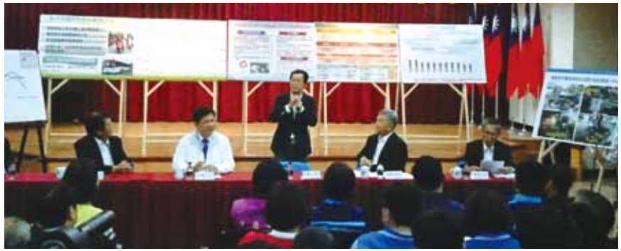
↑ EPA Minister Ying-Yuan Lee (third from right), Minister of Economic Affairs Jong-Chin Shen (second from right) and Mayor of Taichung Chia-Lung Lin (third from left) discuss measures to improve air pollution in central Taiwan.

To handle this issue, the Taichung City Government will build a straw gasification power plant in Waipu Green Energy Ecopark in order to deal with agricultural wastes and promote incineration treatment.